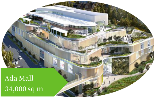
Ada Mall 34,000 sq m

In terms of new developments in the central Belgrade area, two retail formats are set for completion in 2017. Ashtrom’s shopping center in Rajiceva Street and Poseidon Group’s Capitol Park Rakovica, will increase the stock for app. 36,500 sq m of GLA by the end of 2017. After the initiation of the construction works in the previous quarter, the development of GTC’s Ada Mall goes as per the plans, with the completion expected in 2018.