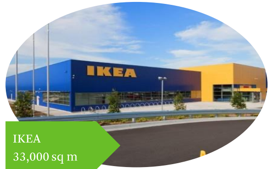
IKEA 33,000 sq m